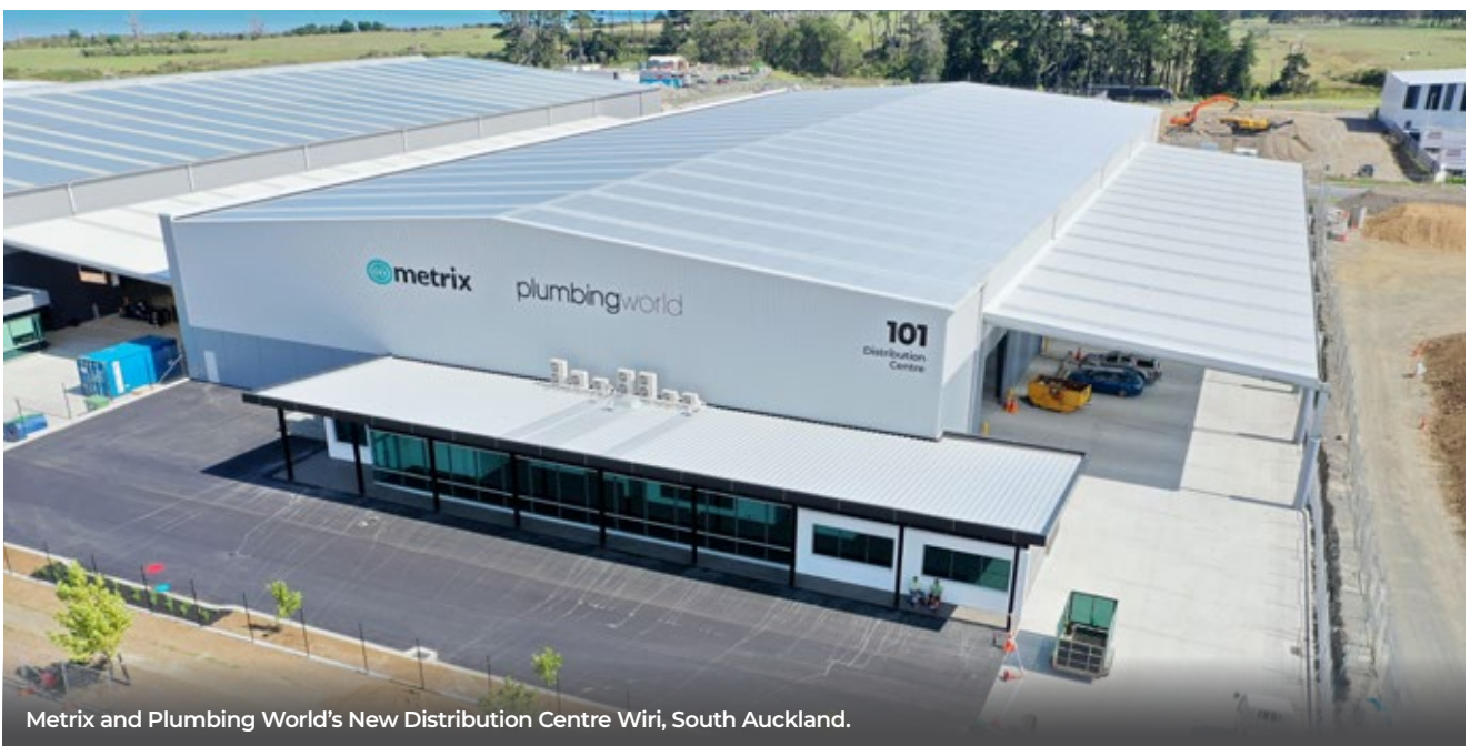
Metrix and Plumbing World's New Distribution Centre Wiri, South Auckland.