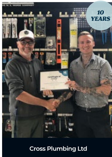
Cross Plumbing Ltd