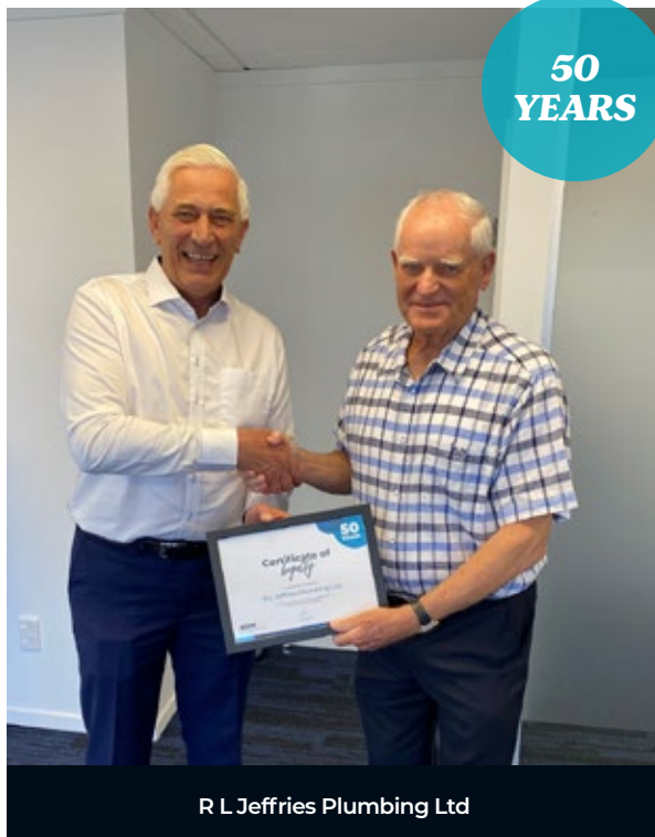
R L Jeffries Plumbing Ltd

We love celebrating your loyalty to our co-operative and it's great to see shareholders being acknowledged. Congratulations to everyone who has recently received their loyalty awards.