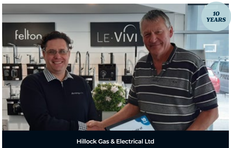
Hillock Gas & Electrical Ltd