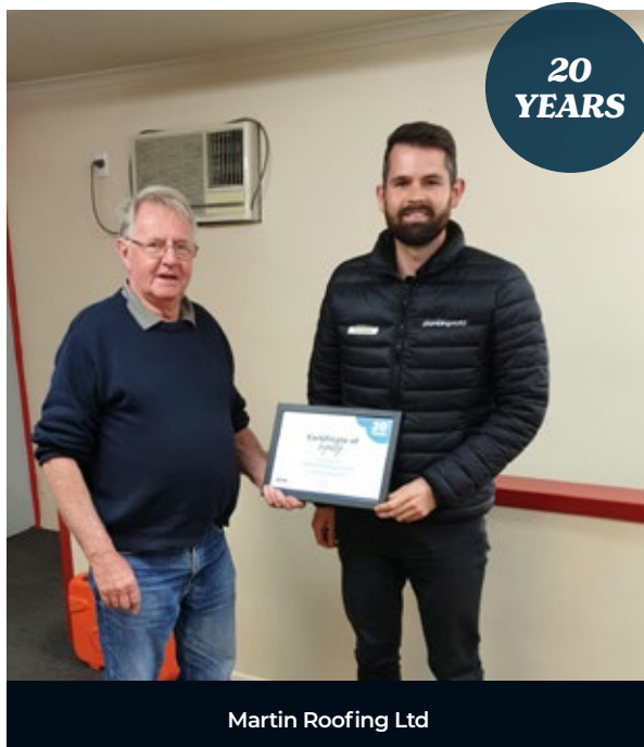
Martin Roofing Ltd