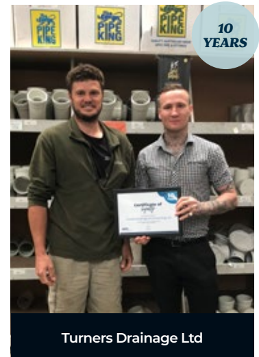
Turners Drainage Ltd