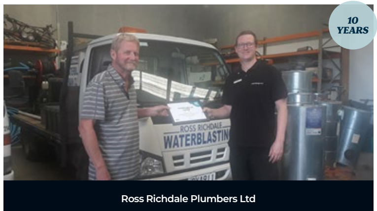
Ross Richdale Plumbers Ltd