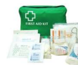
First Aid, Medical and Emergency Preparedness Kits