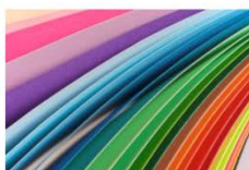
Copy & Business Papers