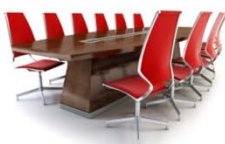
Furniture, Desks, Files, Chairs and more!