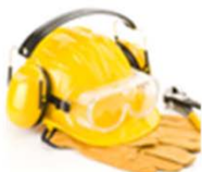
Safety & Personal Protection Equipment