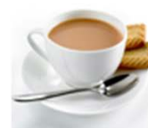
Coffee / Tea Room Supplies