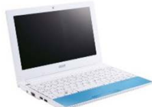
Mobility Technology including Laptops, & Tablets