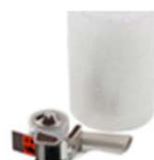
Packaging & Mailing including Postage Paid