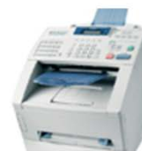
Printers, Copiers, Multifunction Devices