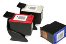
Inks & Toners