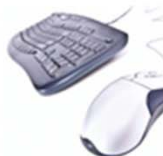
IT Consumables & Peripherals